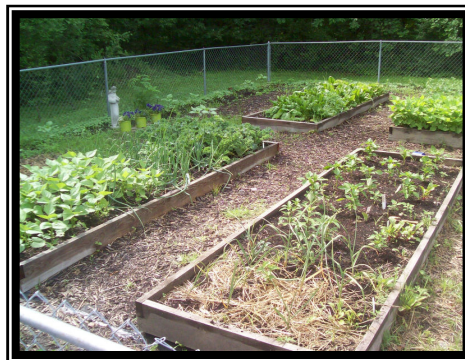
The 1st Fruits of Labor in Our Lady's Garden