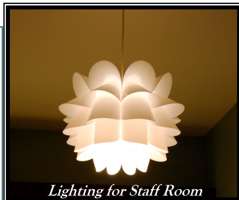
Lighting for Staff Room

With great joy we send this newsletter sharing with you the growth at Our Lady's Montessori!